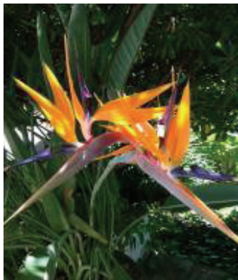
Bird of Paradise at the Finca taken 28/04