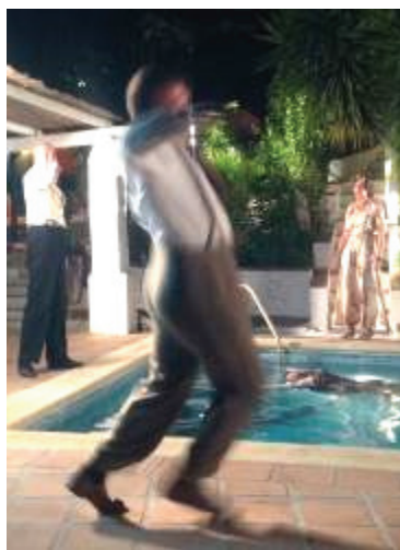
LUPPO another one bites the dust.....